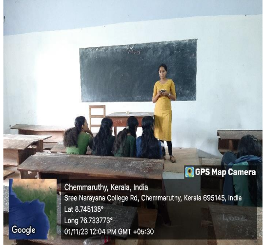
GPS Map Camera Chemmaruthy, Kerala, India Sree Narayana College Rd, Chemmaruthy, Kerala 695145, India Lat 8.745135° Long 76.733773° 01/11/23 12:04 PM GMT +05:30 Google