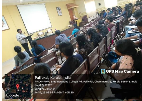
GPS Map Camera Pallickal, Kerala, India PPXM+RHW, Sree Narayana College Rd, Pallickal, Chemmaruthy, Kerala 695145, India Lat 8.749787° Long 76.734916° 14/12/23 02:52 PM GMT +05:30 Google