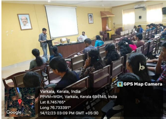
GPS Map Camera Varkala, Kerala, India PPVM+WGH, Varkala, Kerala 695145, India Lat 8.745765° Long 76.733391° 14/12/23 03:09 PM GMT +05:30 Google