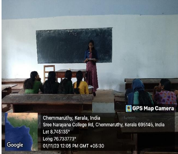
GPS Map Camera Chemmaruthy, Kerala, India Sree Narayana College Rd, Chemmaruthy, Kerala 695145, India Lat 8.745135° Long 76.733773° 01/11/23 12:05 PM GMT +05:30 Google